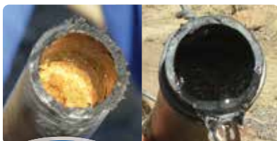
An irrigation pipe blocked with calcium buildup before the water was treated with the DELTA technology (left) and the same pipe after treatment with a DELTA conditioner.