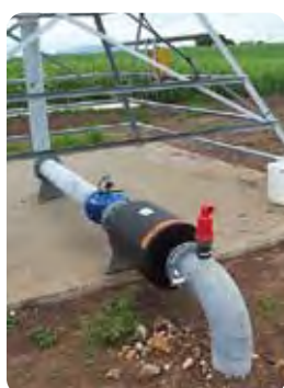
SU-150, Centre Pivot irrigation on sugar cane at Bundaberg, QLD