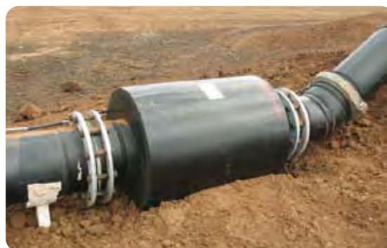
SU-250G3, flood irrigation on fodder crops at Condobolin, NSW