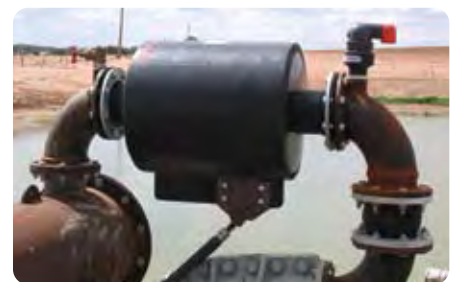
SU-100G3, Centre Pivot irrigation on potatoes at Narrandera, western NSW