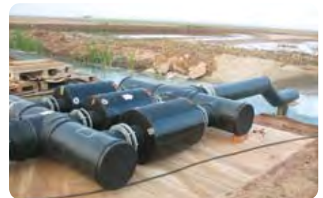
A special-build 300mm DELTA Magnetic Water Conditioner at Whittier Park near Deniliquin.